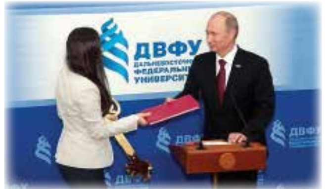
APEC Voices Representative from Russia presenting the APEC Voices Youth Declaration to H.E. Vladimir Putin, President of Russia in Vladivostok, Russia during the APEC Summit, 2012.

H.E. Benigno S. Aquino III President of the Republic of the Philippines, 2015