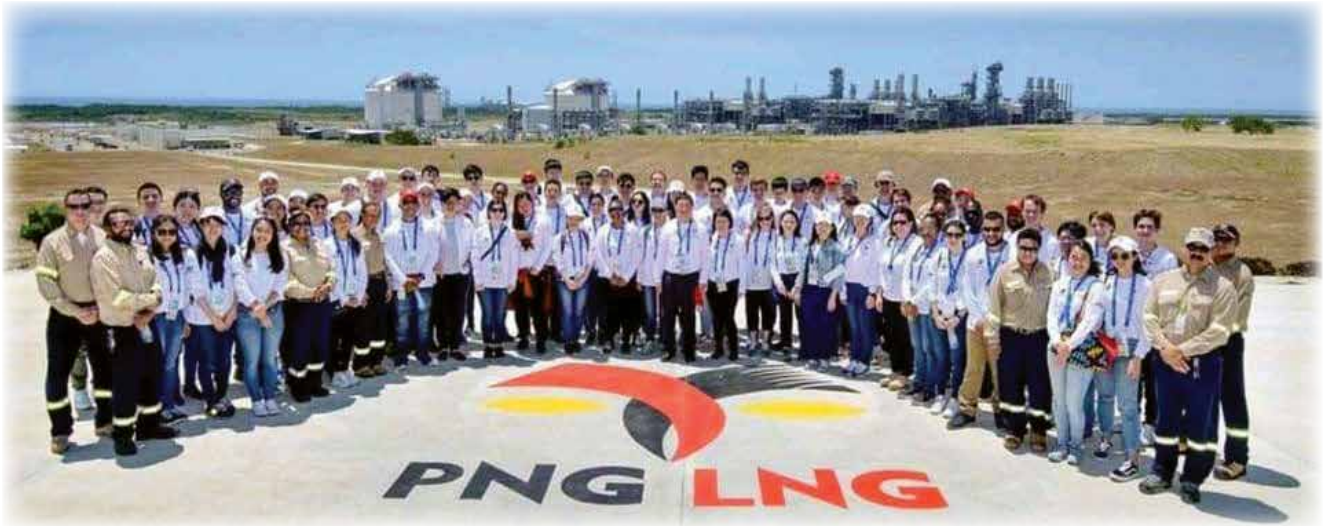
APEC Voices 2018 delegates visiting the ExxonMobil LNG Plant at Caution Bay on the South Coast of PNG's Central Province.

The APEC Voices delegates and educators deserved a good break after their intense discussion at the Youth Forum 2018 on the 3rd day of the APEC Summit. The first order of the day was a specially arranged trip to the ExxonMobil PNG LNG Plant which is located 20 kilometers northwest of Port Moresby, at Caution Bay on the South Coast of PNG's Central Province. The LNG Plant was operating by receiving natural gas from the Hides Gas Conditioning Plant through a 700-kilometre pipeline.