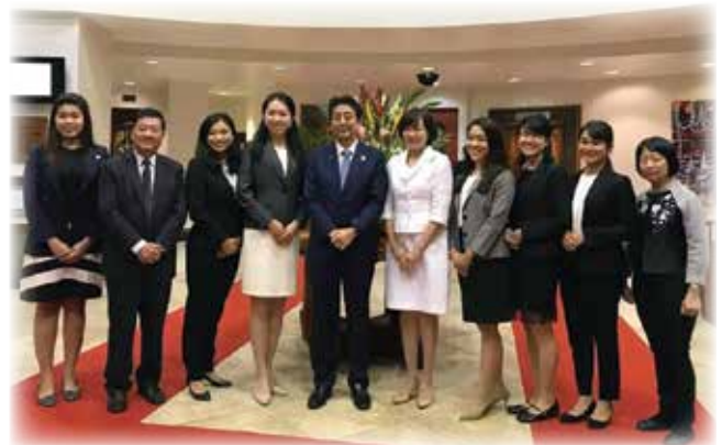
APEC Voices officials and Japanese APEC Voices delegates with H.E. Shinzo Abe, Prime Minister of Japan and Mrs Akie Abe.