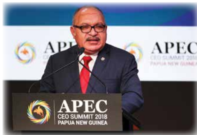
H.E. Peter O'Neill, Prime Minister of Papua New Guinea gracing the Opening Ceremony of the APEC 2018 CEO Summit on board the P&O Cruise Liner, The Pacific Explorer at Port Moresby.

In conjunction with the APEC Economic Leaders' Week 2018, the APEC CEO Summit and ABAC Meeting, the APEC Voices of the Future 2018 was held concurrently in Port Moresby, the capital of Papua New Guinea. The topic for APEC Voices of the Future 2018 was in line with the theme of APEC 2018, “Harnessing Inclusive Opportunities, Embracing the Digital Future”. This addressed harnessing technology for a better future and the role of youth in their own home economies to support digital innovation.