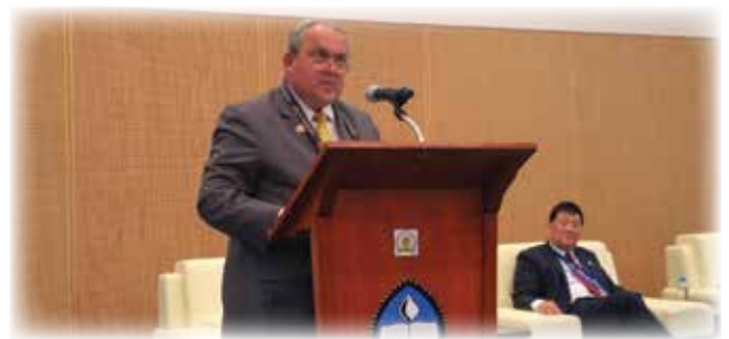
H.E. Justin W. Tkatchenko, Minister for APEC addressing at the Opening Ceremony of the APEC Voices 2018 Youth Summit at the University of Papua New Guinea.

Minister Tkatchenko extended a warm welcome to the APEC Voices delegates and educators from 15 APEC Member Economies to Papua New Guinea, and congratulated the momentous occasion of the 20th Anniversary of the APEC Voices of the Future program. The Minister encouraged the young leaders to fully utilize the platform, engage with APEC and Business Leaders, extend their network with fellow delegates, and work together to create a more vibrant and dynamic Asia-Pacific region. He also encouraged the delegates to explore the rich culture and traditions of Papua New Guinea.