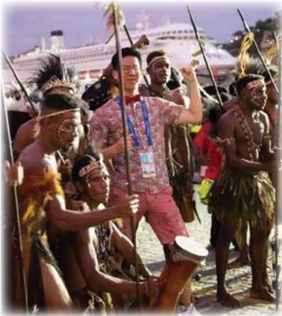
A night of fun and enjoyment for the APEC Voices delegates at the APEC CEO Summit Cultural Night Dinner event.

The APEC CEO Summit 2018 Cultural Night and Dinner - A World of Astounding Diversity was held at the wharf area where delegates were welcomed by various tribal groups in traditional tribal costumes. The party arrived with delicious traditional food and drinks and delegates enjoyed the peaceful seafront ambience with concerts and performances.