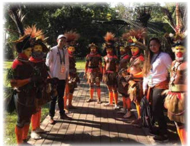
APEC Voices delegates visiting the Port Moresby Nature Park, away from the hustle and bustle of the Port Moresby city area.

After the visit to the ExxonMobil LNG Plant, the delegates proceeded to the Port Moresby Nature Park for lunch, away from the hustle and bustle of the Port Moresby city area. Upon their arrival, the delegates were greeted with song and dance by the tribes donned in traditional tribal outfits. The Port Moresby Nature Park is Papua New Guinea's leading botanical and native zoological park and garden, which showcased the best of PNG's flora and fauna. The park has been home to over 250 native animals, including birds of paradise, tree-kangaroos, cassowaries, wallabies, snakes, crocodiles, hornbills and multiple parrot species.