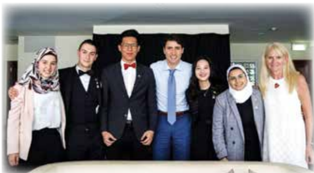
APEC Voices delegates from Canada with H.E. Justin Trudeau, Prime Minister of Canada.

H.E. Dr Mahathir Bin Mohamad Prime Minister of Malaysia