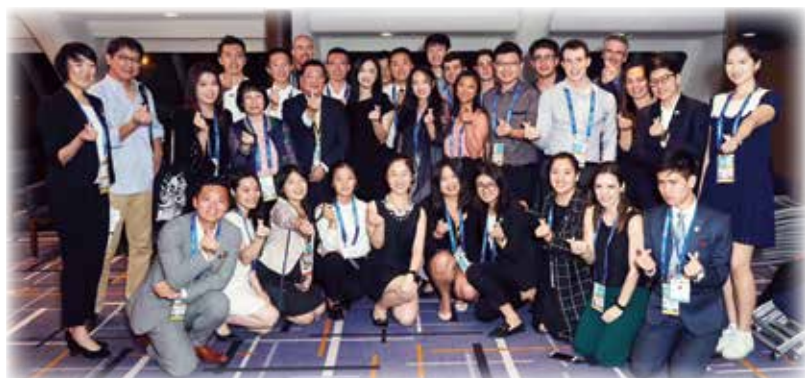
APEC Voices 2018 officials and delegates with Ms Yao Chen, Guest Speaker at the Dialogue Session.

APEC Voices delegates attended a sharing session by Yao Chen, a Chinese actress and philanthropist. In 2014, Time had named her as one of the most influential people on the Time 100 list. She was also listed by Forbes as the 83rd most powerful woman in the world. Several Western media outlets have even nicknamed her as “China’s answer to Angelina Jolie.” She shared her UN refugee work with the APEC Voices delegates and how she had been making a difference to create an impact for the community in China. She encouraged the young delegates to have a positive attitude and contribute their best for their communities.