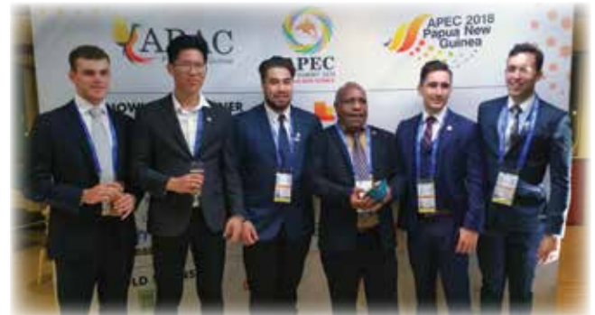
A night of interaction and networking amongst the APEC Voices delegates and business leaders on board The Pacific Explorer.