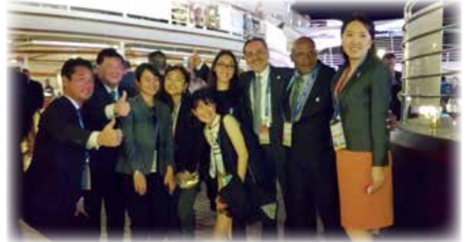
APEC Voices delegates networking with business leaders at the APEC CEO Reception on board The Pacific Explorer.