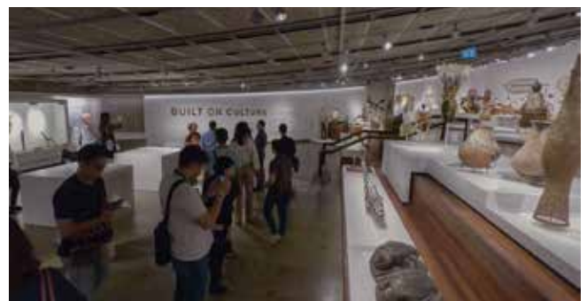
Visiting the National Museum and Art Gallery of Papua New Guinea was a rare treat for the APEC Voices delegates.

During their stay in Port Moresby, delegates also visited the National Museum and Art Gallery showcasing artifacts from 19 provinces of Papua New Guinea, with collections that dated as far back as 1800. The delegates saw the best of PNG as they explored SME stalls at the International Convention Centre, where many local arts and crafts were on display, showcasing the rich tribal culture of Papua New Guinea.