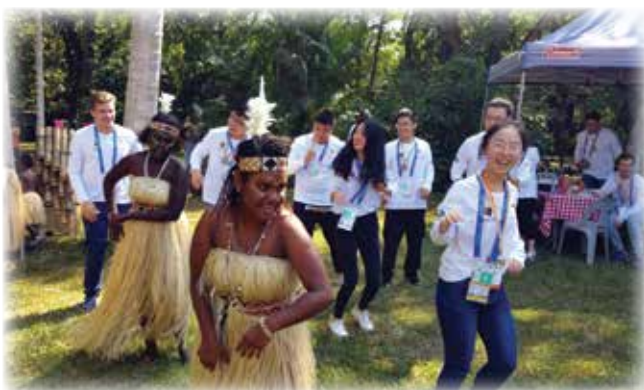
APEC Voices delegates learning the traditional cultural dance at the Port Moresby Nature Park.

During their stay in Port Moresby, delegates also visited the National Museum and Art Gallery showcasing artifacts from 19 provinces of Papua New Guinea, with collections that dated as far back as 1800. The delegates saw the best of PNG as they explored SME stalls at the International Convention Centre, where many local arts and crafts were on display, showcasing the rich tribal culture of Papua New Guinea.