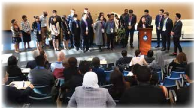
Group presentation from the APEC Voices 2018 delegates on their deliberation at the APEC Voices 2018 Youth Summit.

The delegates were divided into four main groups, and each group was assigned to discuss and tackle issues related to various topics, namely: Harnessing Technology for a Better Future, the Role of Education in Preparing our Youth for the Future, Digital Innovation: Opportunities and Challenges for our Young People and Harnessing Inclusiveness: Challenges and Opportunities. The delegates then disbursed to various parts of the campus for their deliberations.