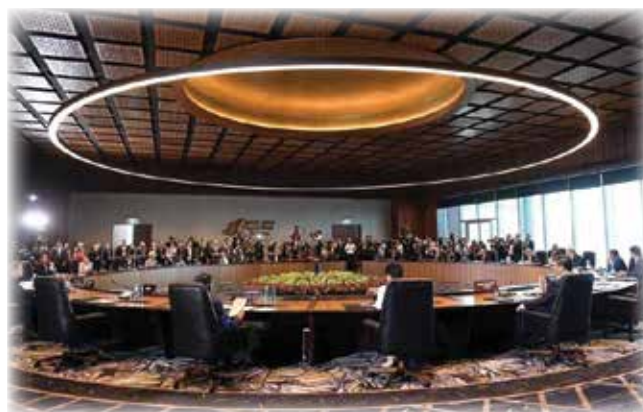
APEC Economic Leaders' Meeting 2018 hosted by H.E. Peter O'Neill, Prime Minister of Papua New Guinea at the APEC Haus, Port Moresby.