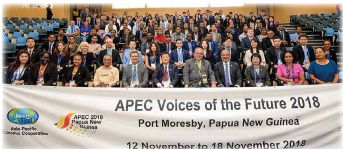
APEC Voices 2018 officials and delegates from the 15 APEC Member Economies at the APEC Voices 2018 Opening Ceremony held at the University of Papua New Guinea.