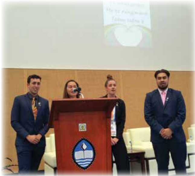
Team from APEC Voices New Zealand presenting their Economy Report at the APEC Voices 2018 Youth Summit.