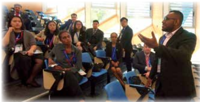
Intense discussion among the APEC Voices 2018 delegates on issues concerning young people in their respective APEC Members Economies.