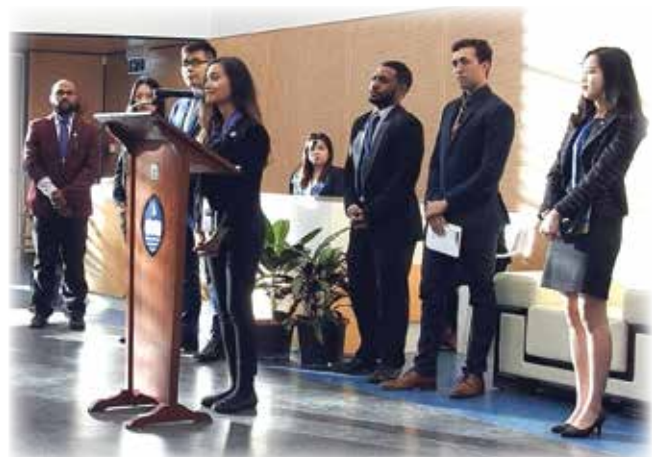
Group presentation on their discussion at the APEC Voices 2018 Youth Summit.

The group presentations were of high standards with much in-depth discussion, and the delegates articulated themselves well during the question-and-answer sessions. To tackle the issue of inclusivity, one group suggested coming up with APEC key performance indicators for each APEC economy so that the APEC Leaders would be able to better identify gaps and produce targeted solutions. Delegates also recognized the importance of education and that some economies do not have equal access to education. They hence proposed an APEC Youth Fund that could benefit and provide struggling economies with necessary resources for an improved education system for young people. The representatives worked vigorously through the night on board the cruise ship to finish the tasks assigned.