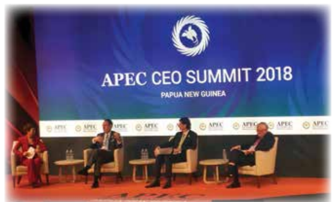
APEC CEO Summit 2018 held at the auditorium on board the Cruise Liner The Pacific Explorer.