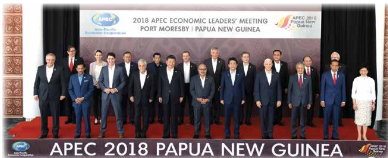
Leaders from the 21 APEC Member Economies gathering for the official group photograph during the APEC Leaders' Week 2018 in Port Moresby, Papua New Guinea.