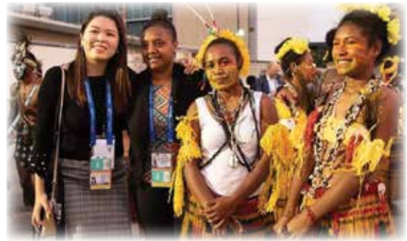
APEC Voices delegates with tribal members at the Cultural Night and Dinner event.