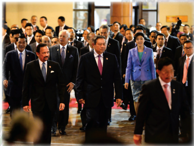
H.E. President Susilo Bambang Yudhoyono arriving at the The APEC Leaders' Retreat with APEC Leaders.

APEC Voices of the Future, which is the main platform for 'Youth Voice' at the annual APEC Summit, was held in conjunction with the APEC Leaders' Week and the APEC CEO Summit from 2 to 8 October 2013 in Bali, Indonesia. More than 130 APEC Voices educators and youth delegates from 17 APEC member economies, namely Australia, Brunei Darussalam, Canada, People's Republic of China, Chinese Taipei, Japan, Korea, Malaysia, Mexico, New Zealand, Peru, Philippines, Russia, Singapore, Thailand, United States of America and Vietnam, gathered in Bali to engage business and political leaders from the 21 APEC member economies.