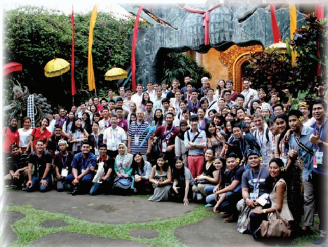
APEC Voices delegates at the Ronji Museum, Bali.

Delegates were given some free time to shop and hunt for souvenirs at the traditional craft market before visiting the famous Blanco Museum and having dinner at the Rondji Restaurant, Blanco Museum.