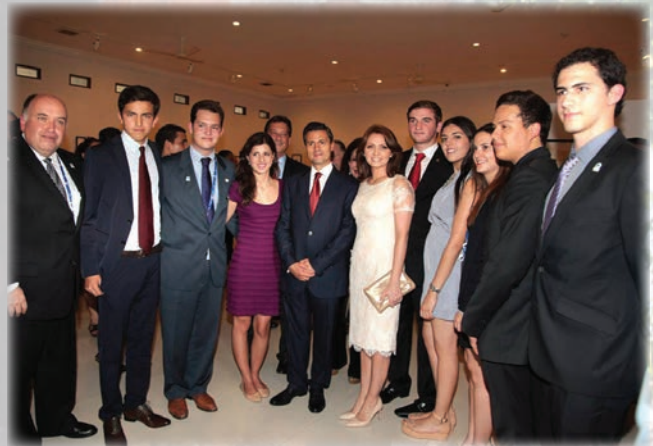
The APEC Voices delegates of Mexico with H.E. Enrique Peña Nieto, President of Mexico and the First Lady Angelica Rivera.