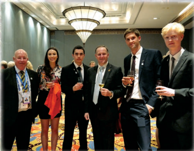
The New Zealand APEC Voices delegates with H.E. John Key, Prime Minister of New Zealand.