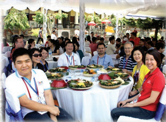
Traditional lunch at the Royal Palace grounds at the seat of the Gelgel Dynasty.