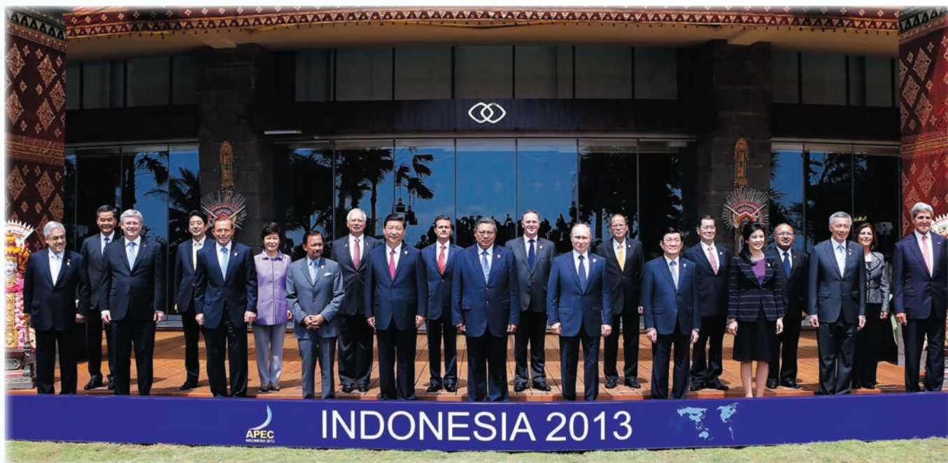
Leaders from the 21 APEC Economies gathered in Bali, Indonesia for the APEC Leaders' Week hosted by H.E. Susilo Bambang Yudhoyono, President of the Republic of Indonesia.