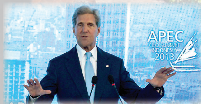
APEC Summit keynote address on America's Priorities for the Global Economy: America's Leadership and Priorities: What they mean for the World by U.S. Secretary of State, H.E. John Kerry who represented H.E. President Barack Obama, President of the United States, at the APEC Summit.