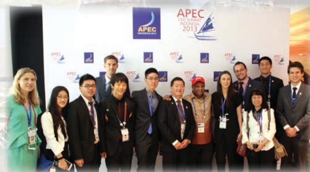
APEC Voices delegates with Tan Sri Tony Fernandes, Group CEO, AirAsia.

The Youth Forum 2013 drew many questions from the APEC Voices delegates, and it was indeed a very engaging forum. Youth leaders took away much valuable information from their engagement with business leaders from the region.