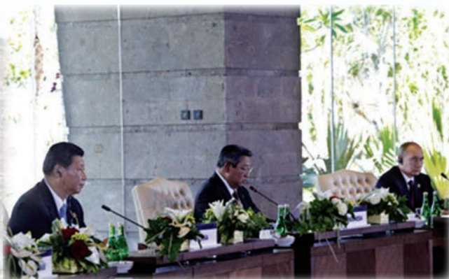
The meeting chaired by H.E. President Susilo Bambang Yudhoyono at the APEC Leaders' Retreat in Bali, Indonesia.