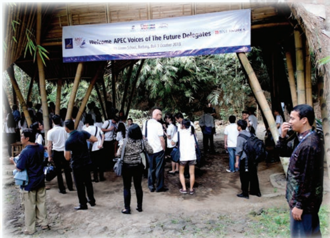
APEC Voices delegates visiting the Green School in Bali, Indonesia.

The Green School in Bali is an international school offering preschool to high school education. Its goal is to be the model of sustainability education in the world. With striking bamboo architecture and a solar-powered campus that spans 20 acres, the school has attracted 333 students from more than 45 countries seeking a unique, nature-based, student-centered education.