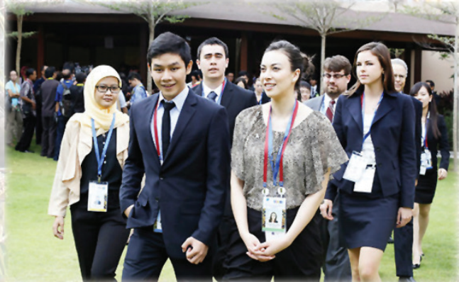
The new generation of youth leaders from the Asia Pacific Region engaging APEC Leaders and Business Leaders during the APEC Week in Bali, Indonesia.

H.E. Susilo Bambang Yudhoyono President of the Republic of Indonesia