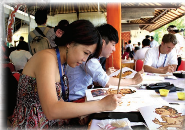
APEC Voices delegates experiencing the traditional Kamasan painting at the Kamasan Art Village.

The visit to Kamasan Art Village was one of the highlights of the APEC Voices 2013. APEC Voices delegates received a very warm welcome from the villagers and community leaders upon their arrival. Kamasan Village is a centre of Balinese traditional painting and sculpting and is located in Klungkung District. The APEC Voices delegates were given the rare treat of learning Balinese traditional painting under the watchful eyes of two famous artists. It was a fascinating experience painting Balinese traditional paintings under Indonesia's highly skilled artisans.