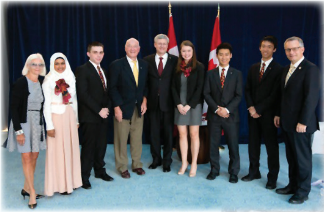
Canadian Youth delegation with the Prime Minister of Canada, H.E. Stephen Harper and Minister of International Trade, H.E. Ed Fast.