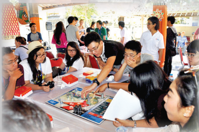
Youth delegates participating in Business Games at the Kamasan Village Community Hall.