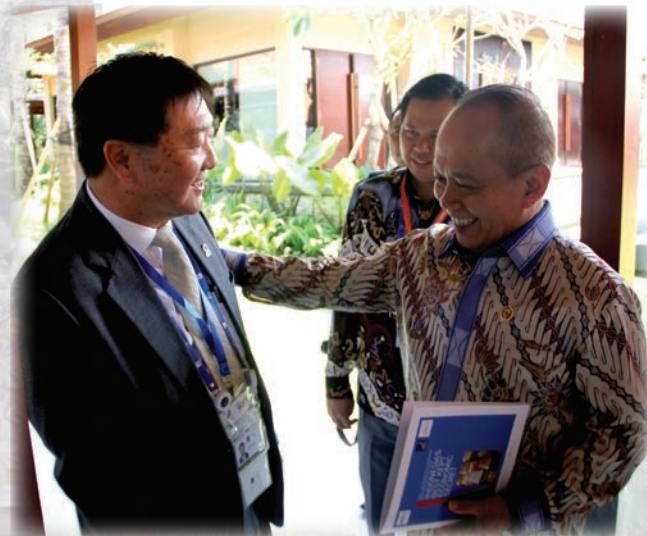
H.E. Syarifuddin Hasan, Minister for Cooperatives and SMEs of the Republic of Indonesia, welcoming Mr Soh to the APEC SME Summit in Bali.

APEC Voices delegates were invited to attend the APEC SME Summit held at the Ayana Resort graced by H.E. Syarifuddin Hasan, State Minister for Cooperatives and SMEs. The SME Summit showed the APEC Voices delegates the challenges faced by SMEs at a global level.