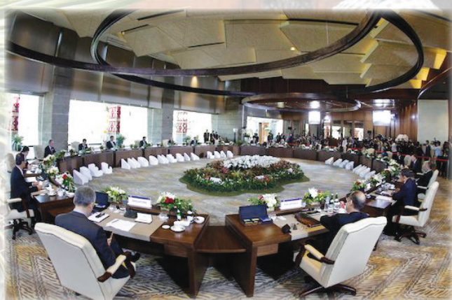
The APEC Leaders' Retreat hosted by H.E. President Susilo Bambang Yudhoyono of the Republic of Indonesia in Bali during the APEC Leaders' Week.

During the annual APEC Leaders' Week, APEC leaders took the opportunity of this platform to interact with each other, discussing and ironing out trade and investment issues in an open and forthright manner.