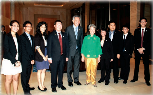
The Singapore APEC Voices delegates with H.E. Lee Hsien Loong, Prime Minister of the Republic of Singapore and Mrs Lee.

H.E. Gita Irawan Wirjawan Minister of Trade Republic of Indonesia