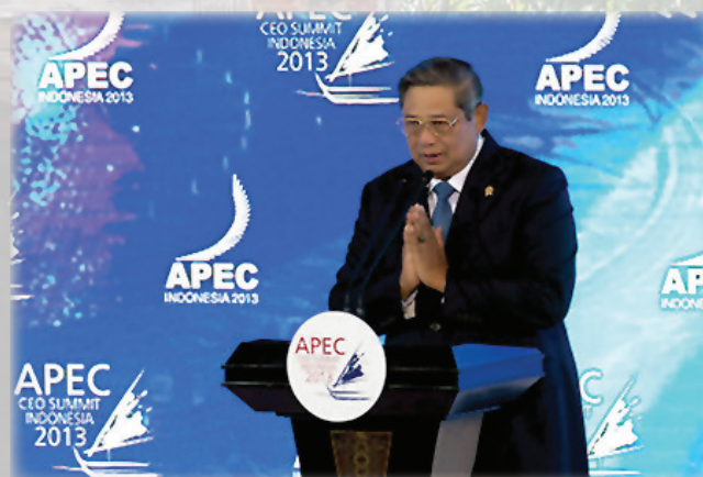
H.E. Susilo Bambang Yudhoyono, President of the Republic of Indonesia, gracing the Opening Ceremony of the APEC CEO Summit 2013 at the Bali Convention Centre.

The Summit was held in the beautiful island of Bali and hosted by H.E. Susilo Bambang Yudhoyono, President of the Republic of Indonesia, who showed great leadership and sincerity in providing an environment conducive to achieving objectives that will benefit the Asia Pacific region.