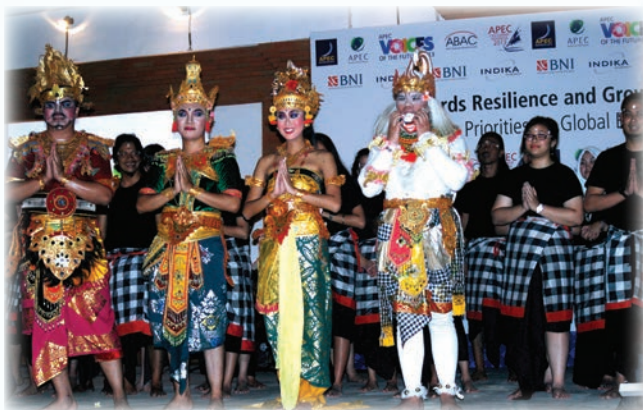
Kecek Dance performance by the APEC Voices delegates from Indonesia.