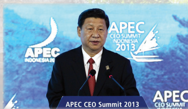
APEC Summit keynote address on China in transition: What can the Asia Pacific expect? by H.E. President Xi Jinping of the People's Republic of China at the APEC Summit.

APEC Voices delegates also had the opportunity to meet their respective heads of government during the APEC Leaders' Week in Bali.