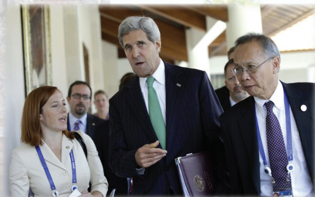
H.E. John Kerry, Secretary of State, United States of America attending the APEC Leaders' Week in Bali.

The Indonesian government, APEC Host Committee 2013 and ABAC Indonesia provided the APEC Voices delegates with excellent hospitality with VIP status throughout the whole APEC week. H.E. Gita Irawan Wirjawan, Minister of Trade of the Republic of Indonesia, extended a very warm welcome to the APEC Voices delegates and called upon the youth delegates, who represent the next generation of leaders, to take up the responsibility of promoting a stronger regional economy among the APEC member economies. He strongly believed that through the friendship, better understanding and bonds forged between delegates from the different economies during the APEC week, the APEC Voices of the Future delegates would grow to be connected leaders of tomorrow who will be well-placed to play key roles in creating a better world in line with the goals of APEC. He emphasised how the APEC Summit provides an excellent platform and opportunity for youth who are future leaders to cement the already good relations among the 21 APEC member economies even more.