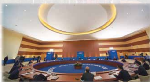
APEC Leaders Meeting held at Russky Island, Vladivostok, Russia.