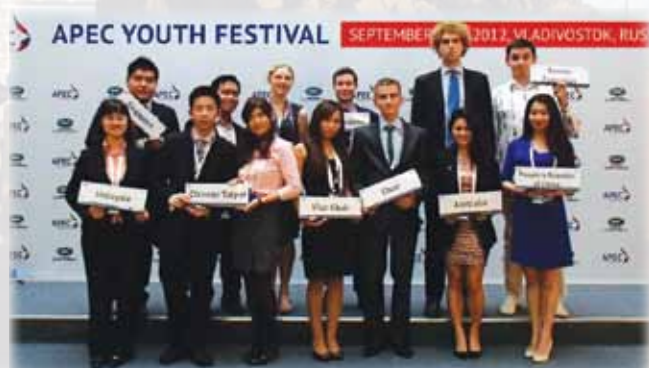
APEC Voices delegates with youth representatives from the APEC Member Economies at the SME Working Group during the APEC Youth Festival 2012.