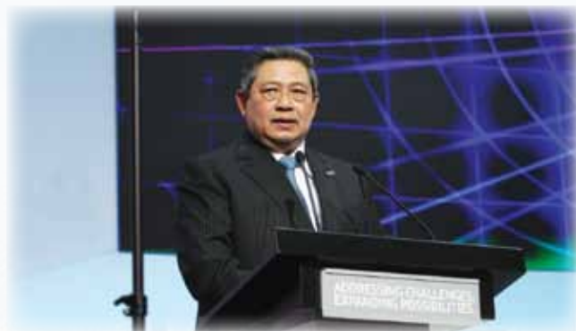
H.E. Susilo Bambang Yudhoyono, President of Indonesia addressing the APEC CEO Summit 2012.

"The APEC Summit 2012 provides an excellent platform for the APEC Voices delegates to be active participants, which allow them to learn about international trade, and have a more comprehensive view towards the working of APEC."