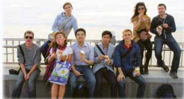
APEC Voices delegates enjoying Russian ice cream at the Vladivostok sea front after the APEC Summit 2012.

The APEC Voices Leadership Council would like to thank the Government of the Russian Federation, Primorsky Regional Government, Russia APEC Host Committee, APEC Business Advisory Council of Russia and the National Youth Achievement Award Council of Singapore for making the APEC Voices of the Future 2012 in Vladivostok, Russia a success.