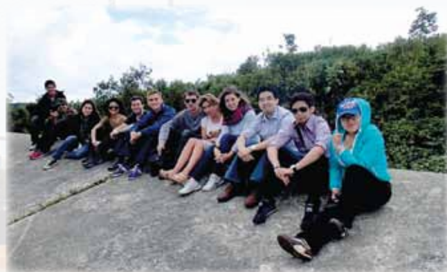
APEC Voices delegates with their Russian friends visiting the old Russian Fortress in Vladivostok after the APEC Summit 2012.