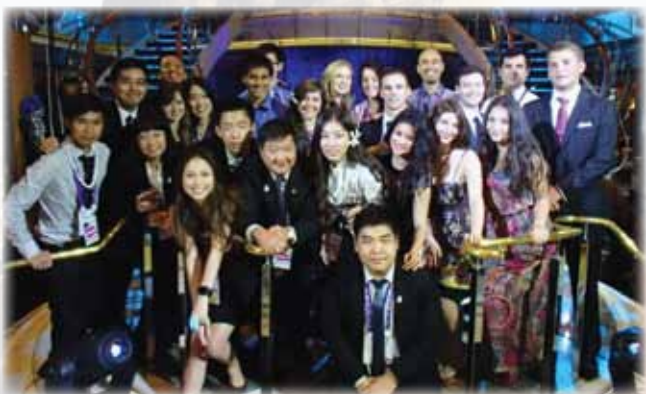
APEC Voices delegates at the APEC Summit 2012 closing dinner on board the cruise ship 'Legend of the Seas' in Vladivostok.