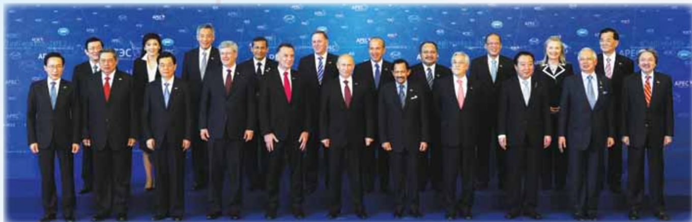
Leaders from 21 APEC Member Economies gathered at the Far Eastern Federal University at Russky Island, Vladivostok, Russia for the APEC Leaders' Week 2012 hosted by H.E. Vladimir Putin, President of the Russian Federation.

A Special Report on the APEC Voices of the Future's Participation at the APEC Summit 2012, Vladivostok, Russia