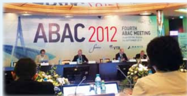
APEC Business Advisory Council Meeting on board the cruise ship 'Legend of the Seas' in Vladivostok, Russia.

After the APEC Youth Festival, the APEC Voices delegates moved on to attend the APEC Business Advisory Council (ABAC) Meetings, where senior business leaders from the Asia Pacific region and the world discussed issues pertaining to trade and policies and addressed various concerns. It was indeed an eye-opener for many of the APEC Voices delegates who had the opportunity to interact and discuss issues and their concerns with business leaders.