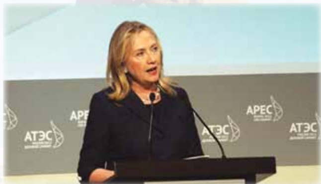
H.E. Hillary Rodham Clinton, U.S. Secretary of State addressing the APEC CEO Summit 2012.