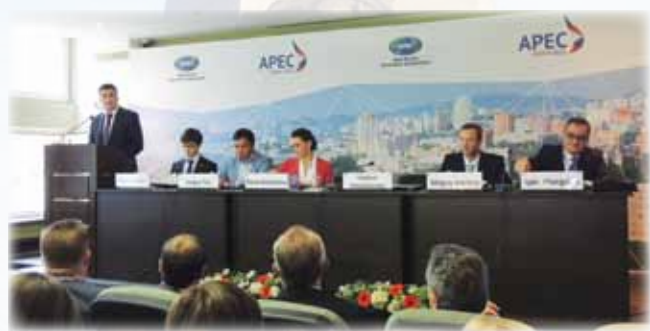
The Honourable Vladimir Miklushevsky, Governor of Primorsky Region addressing the opening of the APEC Youth Festival 2012 at the Far Eastern Federal University.

The APEC Youth Festival provided youth representatives from the APEC Member Economies a platform to discuss issues within the Asia Pacific region from the current context of the economies including the youth's perspectives on APEC policies and the development of a final youth declaration with recommendations and practical solutions. The Youth Declaration was presented to H.E. Vladimir Putin, President of the Russian Federation during the APEC Leaders' Meeting held at the Far Eastern Federal University Campus at Russky Island.