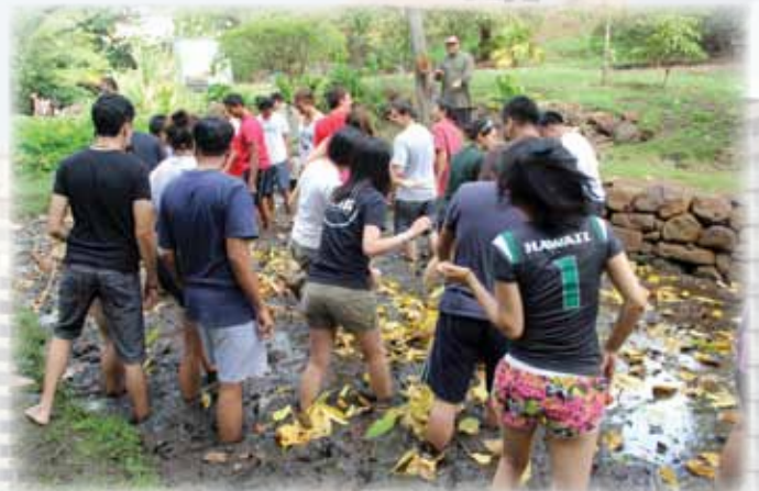
Immersing in Hawaiian culture and building friendships through the Kanewai Lo'i experience.