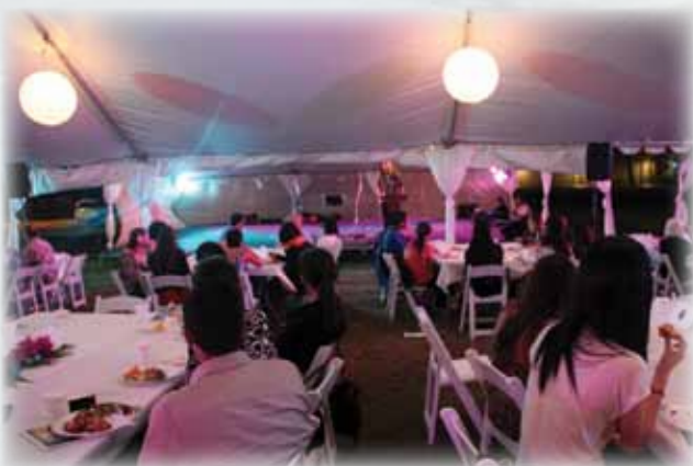
A dinner event hosted by the Bishop Museum for the APEC Voices delegates.