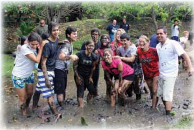
Discovering Kanewai Lo'i, the traditional farming method in Hawaii.

The APEC Voices delegates were also introduced to the Kanewai Lo'i experience on 10 November 2011 at the University of Hawaii. Youth delegates got a rare opportunity to experience the revitalization of traditional Hawaiian values, concepts and practices. They were involved in hands-on Kanewai activities.