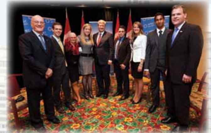
APEC Voices delegates from Canada with H.E. Stephen Harper, Prime Minister of Canada.