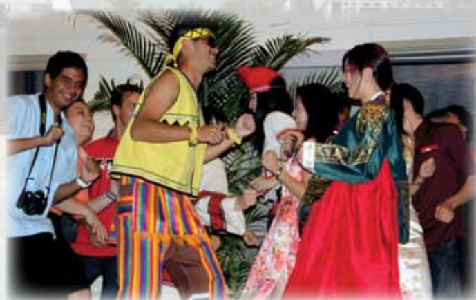
Delegates from different countries participating in a cultural dance at the closing ceremony cum cultural night.