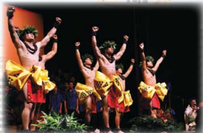
Hawaiian dance performance by students of Kamehameha Schools during the APEC Voices 2011 Opening Ceremony.

Dignitaries such as the United States Congresswoman, Mazie Hirono, and Honorable Peter B. Carlisle, Mayor, City and County of Honolulu, and invited guests attended the ceremony.