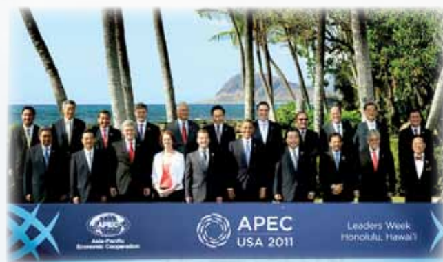
Leaders from 21 APEC Economies gathered in Honolulu, Hawaii for the APEC Leaders' Week hosted by H.E. President Barack Obama.