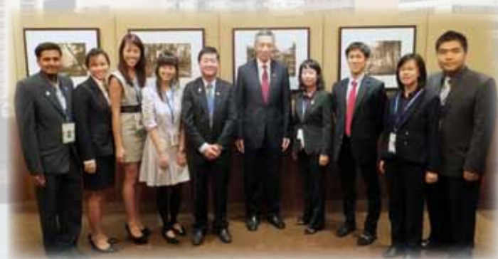
APEC Voices delegates from Singapore with H.E. Lee Hsien Loong, Prime Minister of the Republic of Singapore.