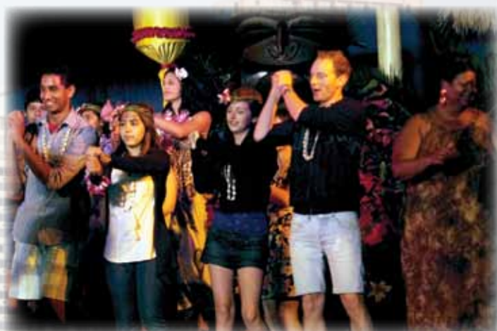
APEC Voices delegates joining in the cultural event at Paradise Cove Lu'au.