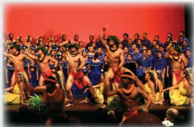
Traditional Hawaiian dance performers at the APEC Voices 2011 Opening Ceremony.