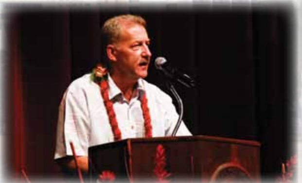
The Honorable Peter B. Carlisle, Mayor, City and County of Honolulu, addressing the audience.