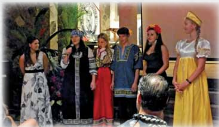
APEC Voices delegates from Russia welcoming youth delegates to the APEC Voices 2012 in Vladivostok, Russia.