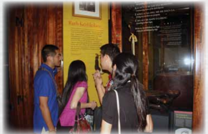
APEC Voices delegates enjoying the rich heritage of the Bishop Museum.