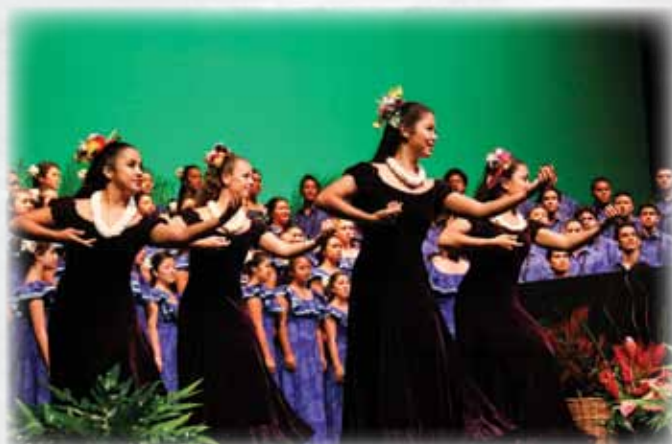
Dancers backed by Kamehameha Schools' choir welcoming the APEC delegates.

The Honorable Peter B. Carlisle Mayor, City & County of Honolulu