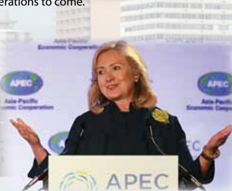
H.E. Hillary Rodham Clinton, U.S. Secretary of State, addressing the APEC CEO Summit.

H.E. Hillary Rodham Clinton Secretary of State United States of America