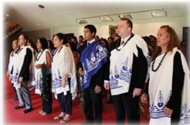
A traditional Hawaiian welcome from staff of Kamehameha Schools.

Prior to the Opening Ceremony, the APEC Voices program kicked off with an orientation evening held at the Pagoda Hotel Ballroom where many delegates met for the first time and were briefed by the APEC Voices 2011 Organizing Committee on what they should know about the APEC Week program.