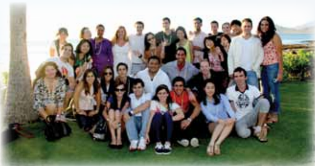
Youth delegates enjoying the beautiful Hawaiian scenery away from downtown Waikiki.

The event also brought much fun and fellowship among the delegates as they mingled with their newfound friends and acquaintances.