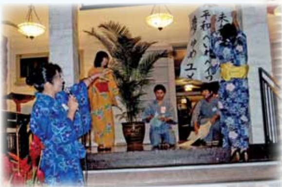
A taste of Japan at the APEC Voices 2011 Closing Ceremony in Honolulu, Hawaii.