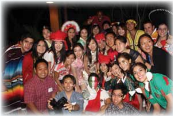
Forging strong friendships among APEC Voices delegates from the Asia Pacific Region at the Closing Ceremony.